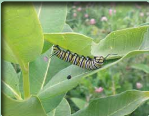
Monarch caterpillar foraging on milkweed

To help foster the creation of habitat for the monarch butterfly, OPHI in cooperation with Ohio Soil and Water Conservation Districts is organizing a Statewide Milkweed Pod Collection this year starting September 1 st and ending October 30 th . Milkweed is essential to the survival of Monarch Butterflies in Ohio and Ohio is a priority area for Monarchs. The monarch butterflies that hatch here in the summer migrate to Mexico for the winter and are responsible for starting the life cycle all over again in the spring. During September and October everyone is encouraged to collect milkweed pods from established plants and drop them off at the nearest pod collection station. The majority of Ohio Counties have a Milkweed Pod Collection Station most of them being located at the local Soil and Water Conservation District office. You can find the location of your local SWCD office: http://www.agri.ohio.gov/divs/SWC/SearchLocalSWCD.aspx